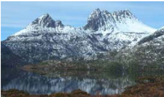
Photo: Dove Lake and Cradle Mountain.