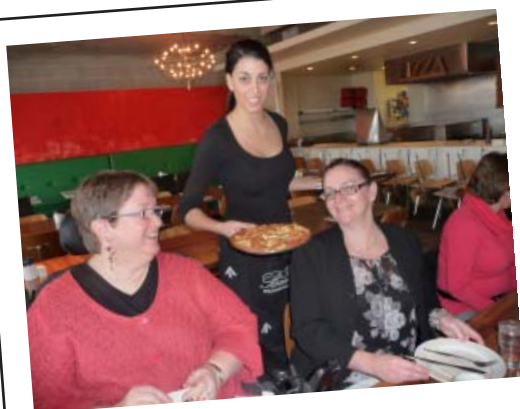
What a feast