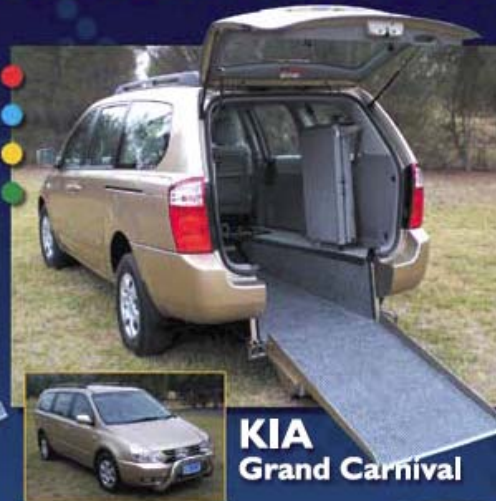
KIA Grand Carnival