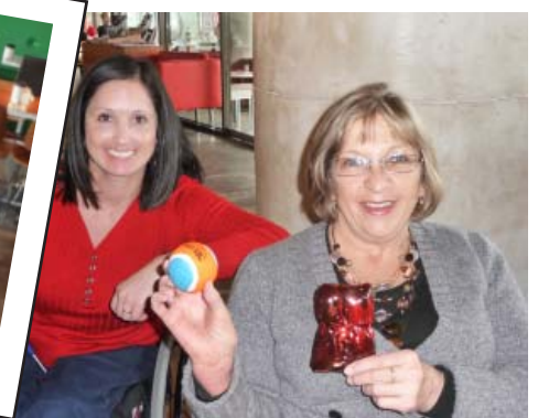
One of the prizes given