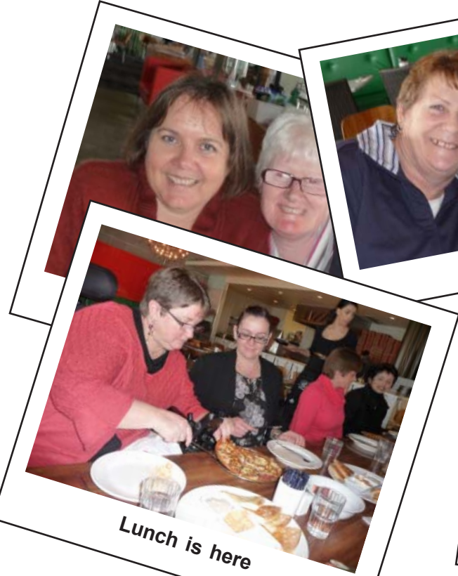
Lunch is here