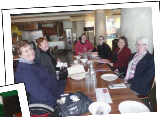
the whole group socialising