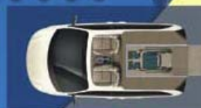
● 2 seater